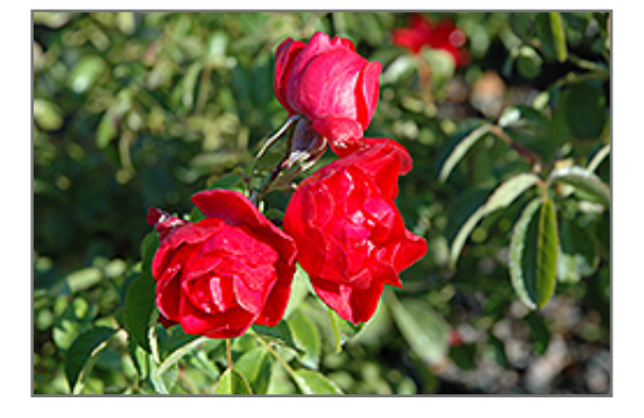
Flower Carpet Scarlet Rose flowers