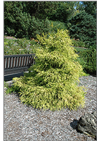
Lemon Thread Falsecypress

Lemon Thread Falsecypress is recommended for the following landscape applications;