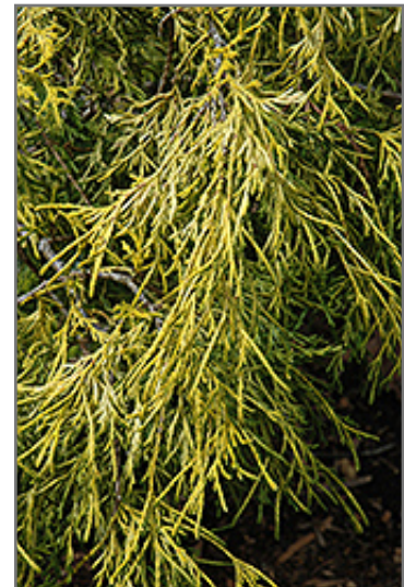
Lemon Thread Falsecypress foliage