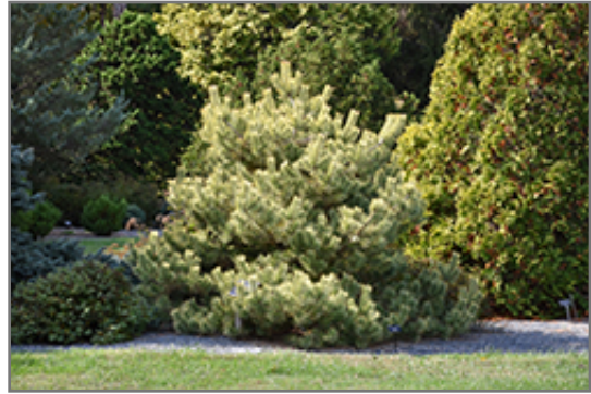
Gold Coin Scotch Pine

Gold Coin Scotch Pine will grow to be about 20 feet tall at maturity, with a spread of 15 feet. It has a low canopy with a typical clearance of 1 foot from the ground, and is suitable for planting under power lines. It grows at a medium rate, and under ideal conditions can be expected to live for 60 years or more.