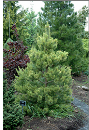
Gold Coin Scotch Pine

This is a relatively low maintenance tree. When pruning is necessary, it is recommended to only trim back the new growth of the current season, other than to remove any dieback. Deer don't particularly care for this plant and will usually leave it alone in favor of tastier treats. It has no significant negative characteristics.