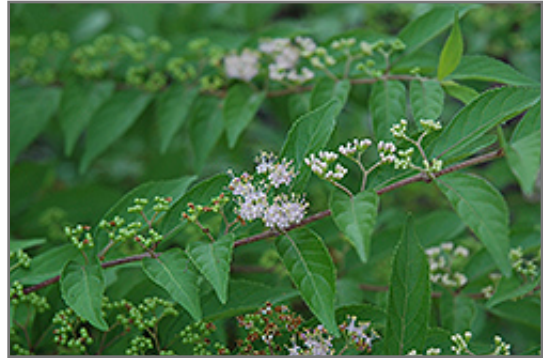
Issai Beautyberry flowers

Issai Beautyberry will grow to be about 4 feet tall at maturity, with a spread of 5 feet. It tends to fill out right to the ground and therefore doesn't necessarily require facer plants in front. It grows at a fast rate, and under ideal conditions can be expected to live for approximately 20 years.