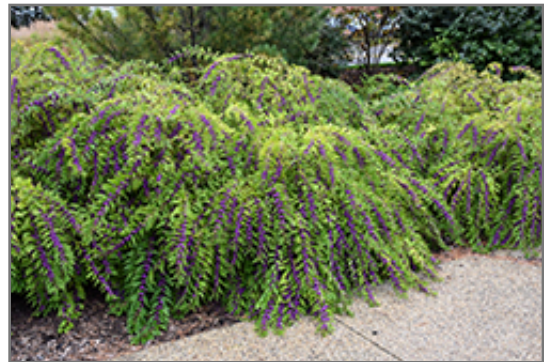
Issai Beautyberry fruit