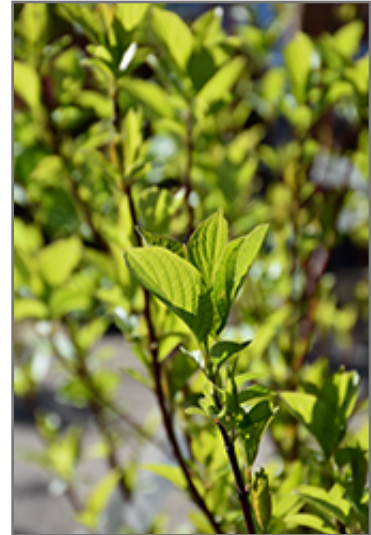
Bailey Red-Twig Dogwood foliage

This shrub does best in full sun to partial shade. It is an amazingly adaptable plant, tolerating both dry conditions and even some standing water. It is not particular as to soil type or pH. It is highly tolerant of urban pollution and will even thrive in inner city environments. This species is native to parts of North America.