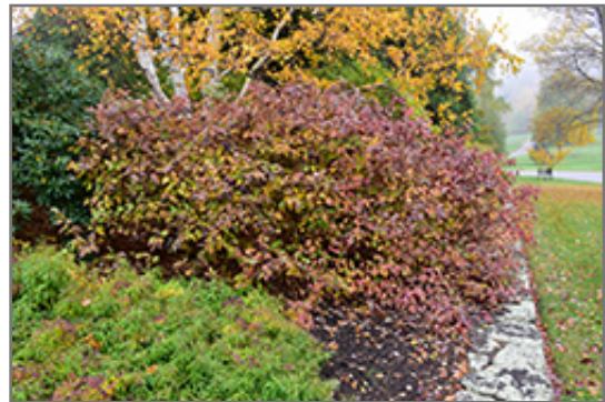
Bailey Red-Twig Dogwood in fall