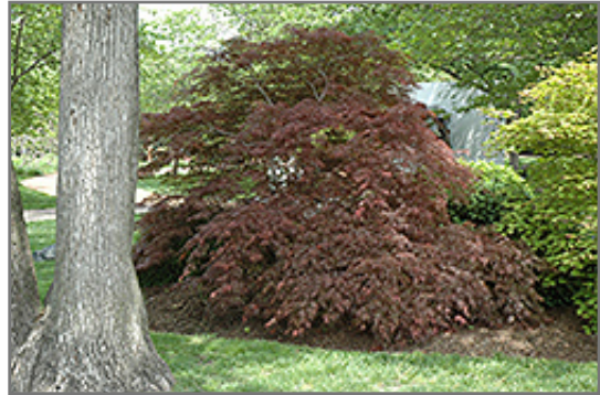
Garnet Cutleaf Japanese Maple

Garnet Cutleaf Japanese Maple will grow to be about 10 feet tall at maturity, with a spread of 8 feet. It has a low canopy with a typical clearance of 1 foot from the ground, and is suitable for planting under power lines. It grows at a fast rate, and under ideal conditions can be expected to live for 60 years or more.