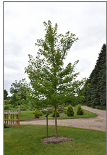
Matador Maple