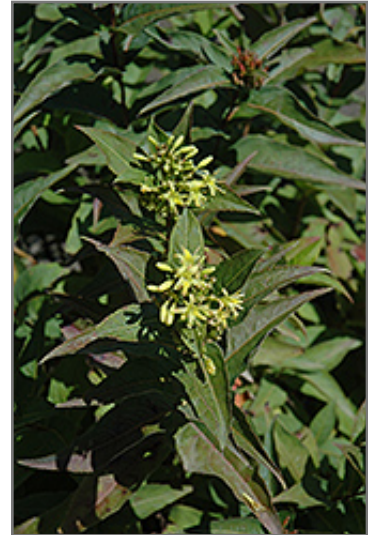
Butterfly Southern Bush Honeysuckle flowers

Butterfly Southern Bush Honeysuckle is recommended for the following landscape applications;