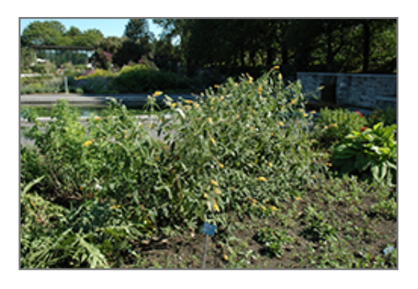
Honeycomb Butterfly Bush in bloom