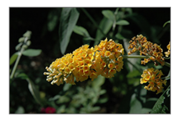
Honeycomb Butterfly Bush flowers

Honeycomb Butterfly Bush is recommended for the following landscape applications;