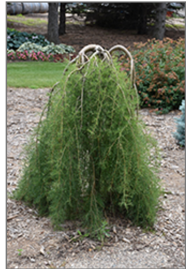
Walker Weeping Peashrub

This dwarf tree does best in full sun to partial shade. It prefers dry to average moisture levels with very well-drained soil, and will often die in standing water. It is considered to be drought-tolerant, and thus makes an ideal choice for xeriscaping or the moisture-conserving landscape. It is not particular as to soil type or pH, and is able to handle environmental salt. It is highly tolerant of urban pollution and will even thrive in inner city environments. This is a selected variety of a species not originally from North America.