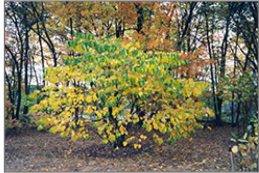
Northern Strain Redbud in fall

* This is a 'special order' plant - contact store for details