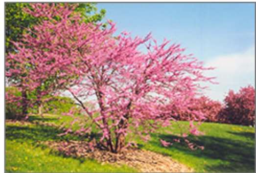
Northern Strain Redbud in bloom