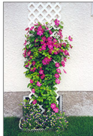
Ville de Lyon Clematis in bloom