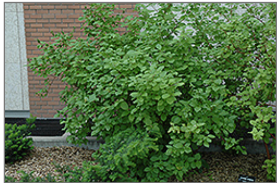
Siberian Dogwood