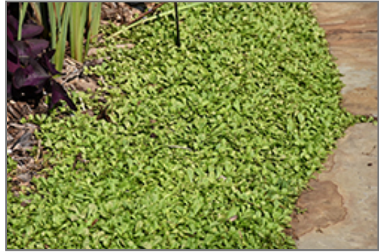
Creeping Mazus

Creeping Mazus will grow to be only 2 inches tall at maturity extending to 3 inches tall with the flowers, with a spread of 12 inches. Its foliage tends to remain low and dense right to the ground. It grows at a fast rate, and under ideal conditions can be expected to live for approximately 10 years. As an evergreen perennial, this plant will typically keep its form and foliage year-round.