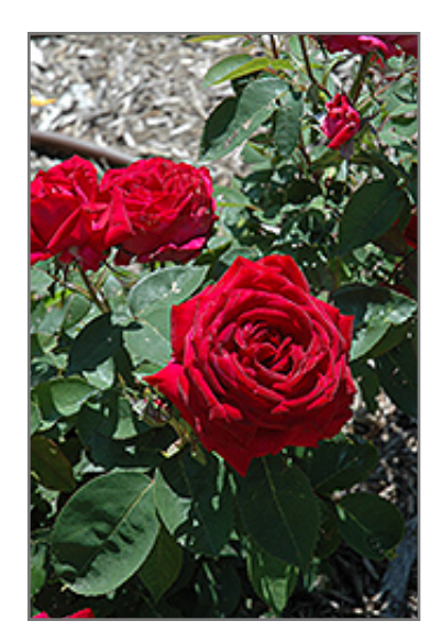
Kashmir Rose flowers