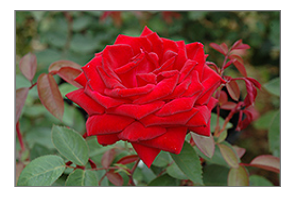
Kashmir Rose flowers

Kashmir Rose is recommended for the following landscape applications;