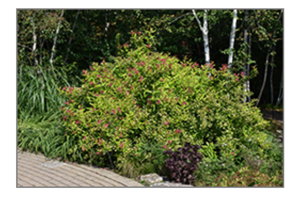
Rubidor Weigela in bloom