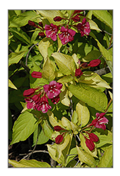
Rubidor Weigela flowers