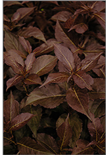
Shining Sensation Weigela foliage

* This is a 'special order' plant - contact store for details