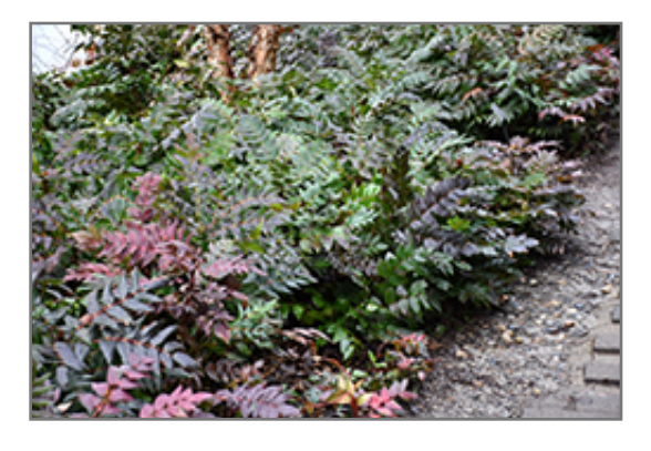
Oregon Grape Holly