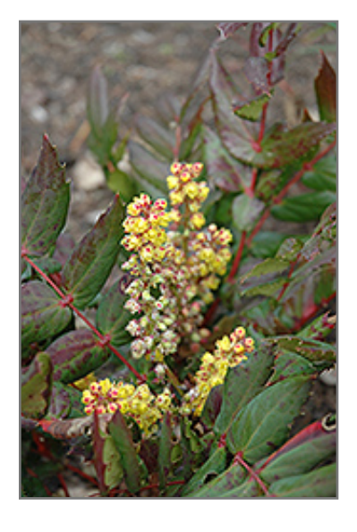
Oregon Grape Holly flowers

Oregon Grape Holly is a multi-stemmed evergreen shrub with a ground-hugging habit of growth. Its average texture blends into the landscape, but can be balanced by one or two finer or coarser trees or shrubs for an effective composition.