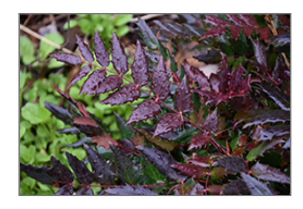
Oregon Grape Holly foliage

This shrub does best in partial shade to shade. It does best in average to evenly moist conditions, but will not tolerate standing water. It is not particular as to soil pH, but grows best in rich soils. It is somewhat tolerant of urban pollution, and will benefit from being planted in a relatively sheltered location. Consider applying a thick mulch around the root zone in winter to protect it in exposed locations or colder microclimates. This species is native to parts of North America.