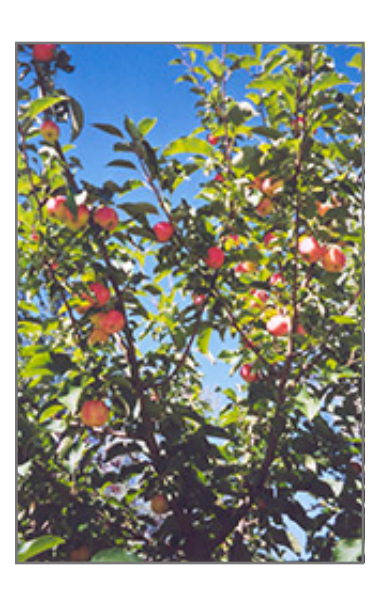
September Ruby Apple fruit