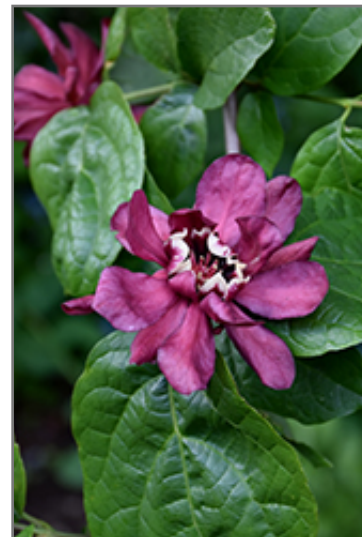
Hartlage Wine Sweetshrub flowers