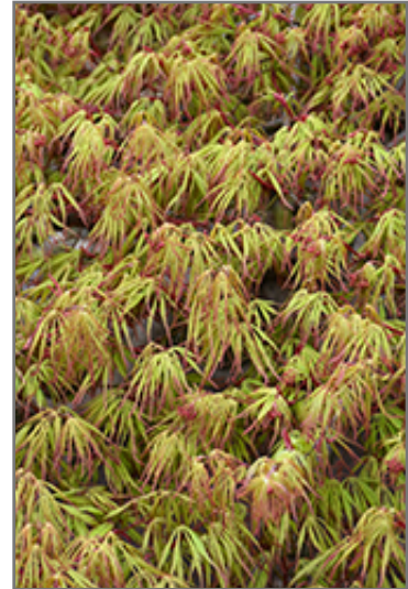
Spring Delight Japanese Maple foliage