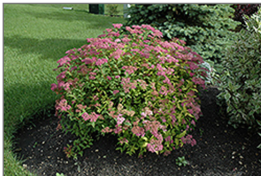
Goldflame Spirea in bloom