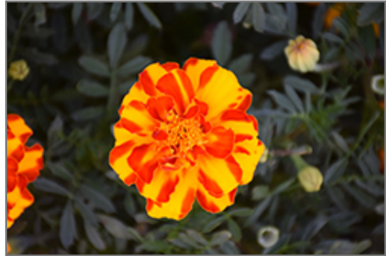
Durango Bolero Marigold flowers