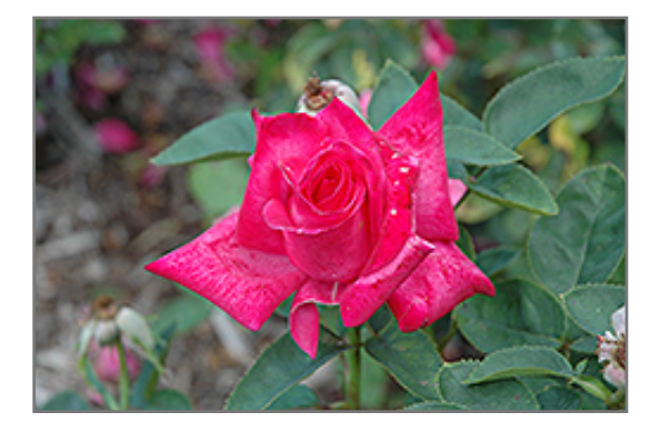
Elizabeth Taylor Rose flowers