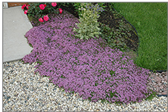
Red Creeping Thyme in bloom