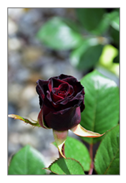
Black Baccara Rose flower buds