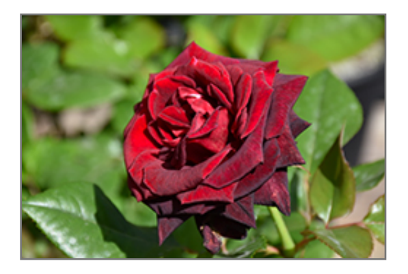
Black Baccara Rose flowers

Black Baccara Rose is recommended for the following landscape applications;