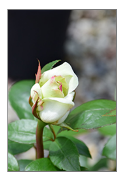
Sugar Moon Rose flower buds

This shrub should only be grown in full sunlight. It does best in average to evenly moist conditions, but will not tolerate standing water. It is not particular as to soil type or pH. It is somewhat tolerant of urban pollution. This particular variety is an interspecific hybrid.