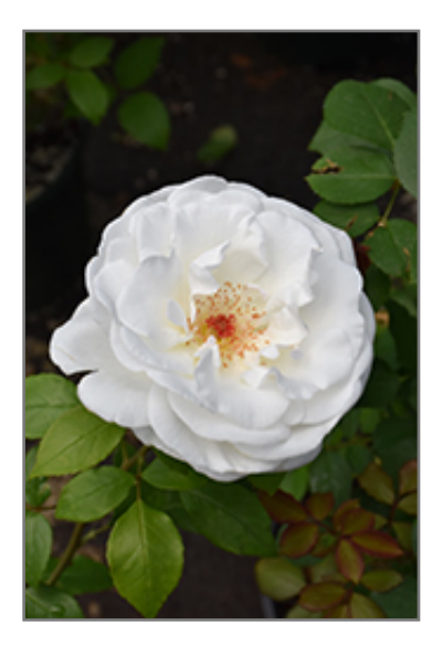
Sugar Moon Rose flowers