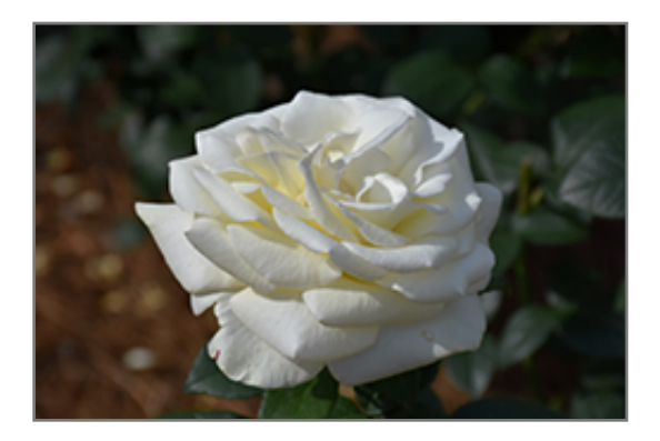
Sugar Moon Rose flowers

Sugar Moon Rose is recommended for the following landscape applications;