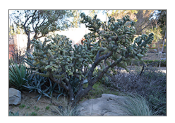
Cholla Cactus