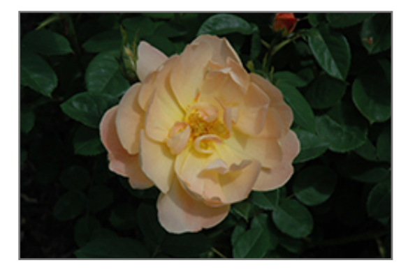
The Lark Ascending Rose flowers