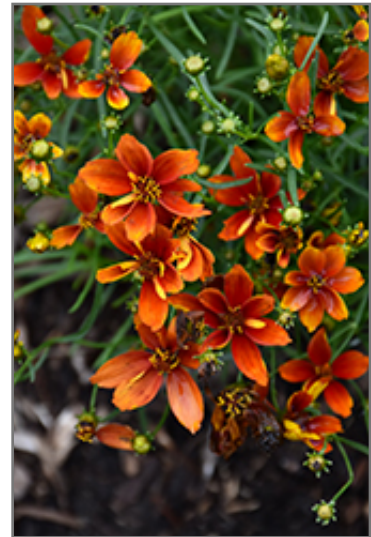
Sizzle And Spice Crazy Cayenne Tickseed flowers

Sizzle And Spice Crazy Cayenne Tickseed is recommended for the following landscape applications;