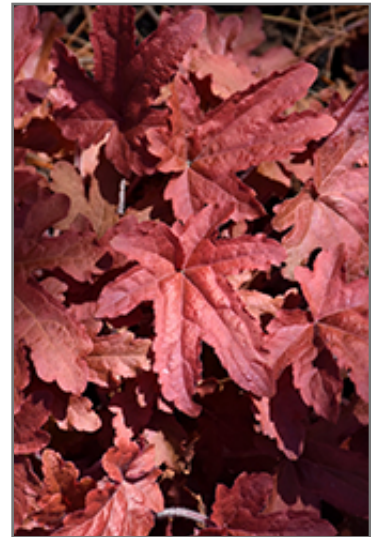
Fun and Games Red Rover Foamy Bells foliage

This is a relatively low maintenance plant, and should be cut back in late fall in preparation for winter. It is a good choice for attracting hummingbirds to your yard. It has no significant negative characteristics.