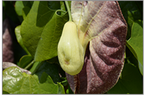
Giant Dutchman's Pipe flowers

This woody vine does best in full sun to partial shade. It prefers to grow in average to moist conditions, and shouldn't be allowed to dry out. It is not particular as to soil type or pH. It is highly tolerant of urban pollution and will even thrive in inner city environments. This species is not originally from North America.