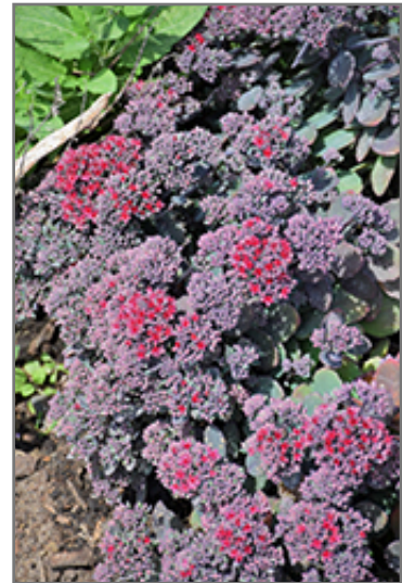
Rock 'N Grow Superstar Stonecrop flower buds

Rock 'N Grow Superstar Stonecrop is a dense herbaceous perennial with a mounded form. Its medium texture blends into the garden, but can always be balanced by a couple of finer or coarser plants for an effective composition.