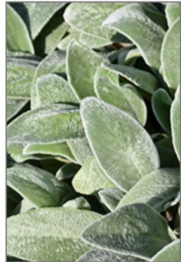
Lamb's Ears foliage

Lamb's Ears is recommended for the following landscape applications;