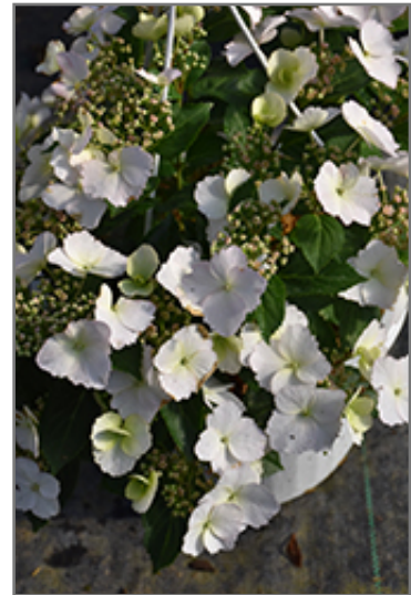
Fairytrail Bride Cascade Hydrangea flowers