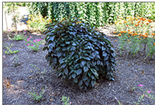
Nightfall Japanese Snowbell