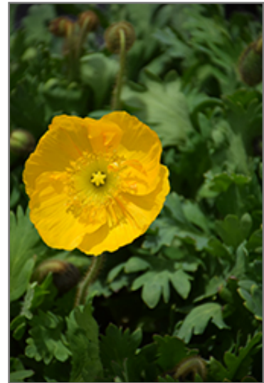
Champagne Bubbles Yellow Poppy flowers

Champagne Bubbles Yellow Poppy is an open herbaceous perennial with tall flower stalks held atop a low mound of foliage. It brings an extremely fine and delicate texture to the garden composition and should be used to full effect.