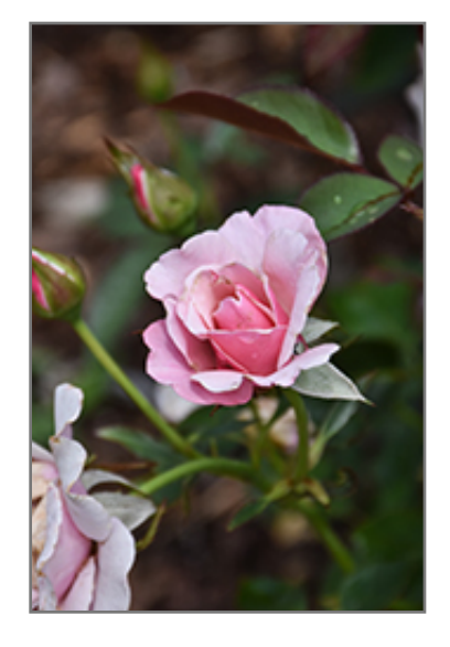
Our Lady Of Guadalupe Rose flowers