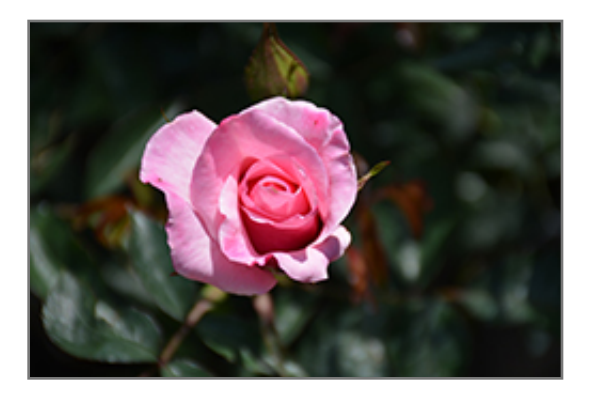
Our Lady Of Guadalupe Rose flowers