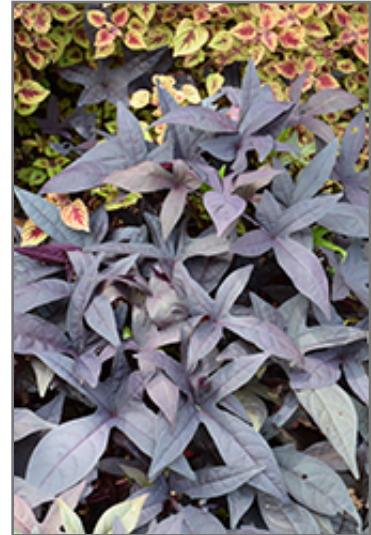
Sweet Georgia Deep Purple Sweet Potato Vine foliage