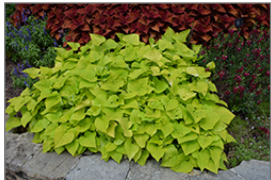
Sweet Georgia Heart Light Green Sweet Potato Vine