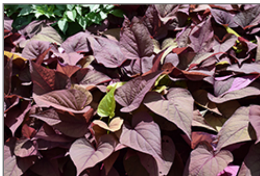
Sweet Georgia Heart Red Sweet Potato Vine foliage

Sweet Georgia Heart Red Sweet Potato Vine is recommended for the following landscape applications;