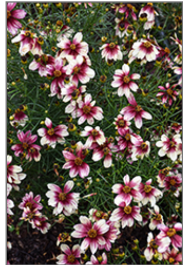
Sizzle And SpiceZesty Zinger Tickseed flowers

Sizzle And SpiceZesty Zinger Tickseed is recommended for the following landscape applications;