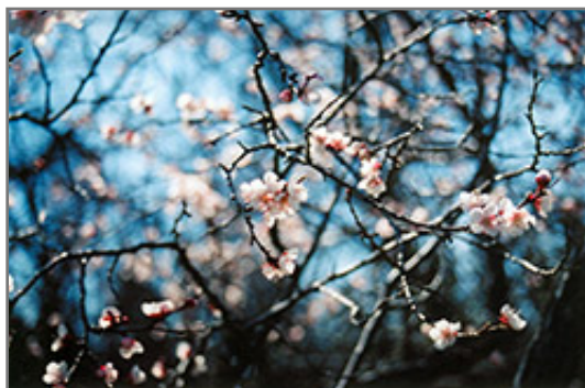
M604 Apricot flowers

M604 Apricot is blanketed in stunning clusters of fragrant shell pink flowers along the branches in early spring, which emerge from distinctive pink flower buds before the leaves. It has green deciduous foliage. The pointy leaves turn yellow in fall. The fruits are showy yellow drupes with gold overtones, which are carried in abundance in late summer. The fruit can be messy if allowed to drop on the lawn or walkways, and may require occasional clean-up.