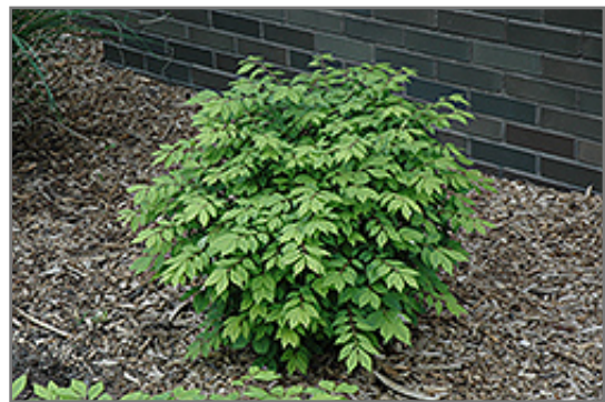
Little Moses Burning Bush