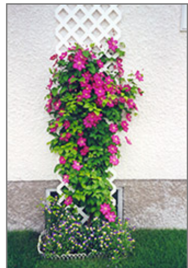
Ville de Lyon Clematis in bloom