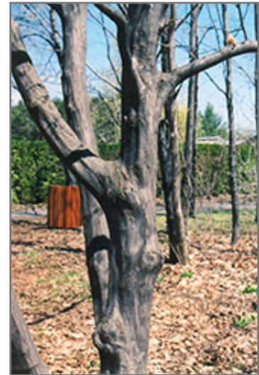
American Hornbeam bark

This tree performs well in both full sun and full shade. It is an amazingly adaptable plant, tolerating both dry conditions and even some standing water. It is not particular as to soil type or pH. It is somewhat tolerant of urban pollution. This species is native to parts of North America.