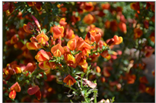
Lena Scotch Broom flowers