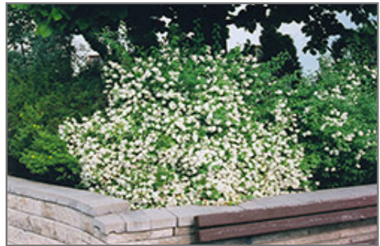
Galahad Mockorange in bloom