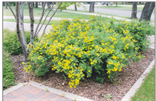
Coronation Triumph Potentilla in bloom