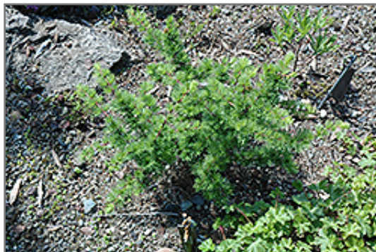
Little Bogle Dwarf Larch